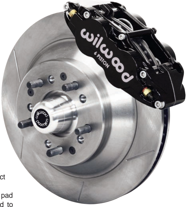
Big Brake Front Kit Assembly with GT Rotor, $1,343.99 as Shown Download High Res Photo, Click Here