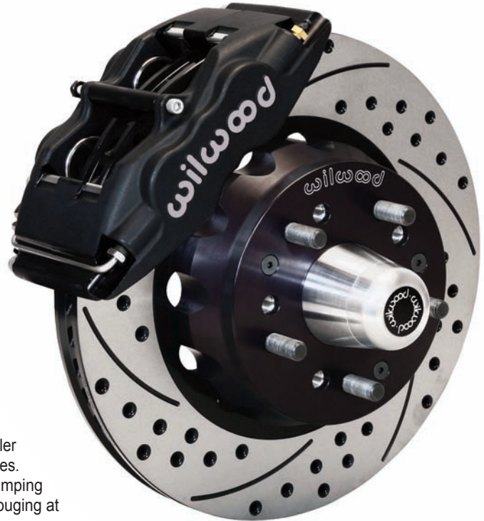
Mustang Big Brake Front Kit with SRP Rotor

Please check the diagram on the back of this page for minimum inside wheel clearance requirements