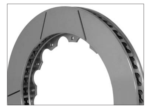
16 Inch SV-GT Rotor