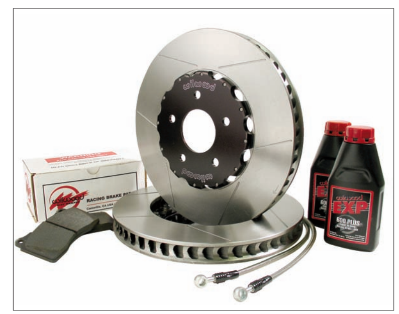
Mitsubishi EVO VIII Pro-Matrix Upgrade Kit with GT Rotor