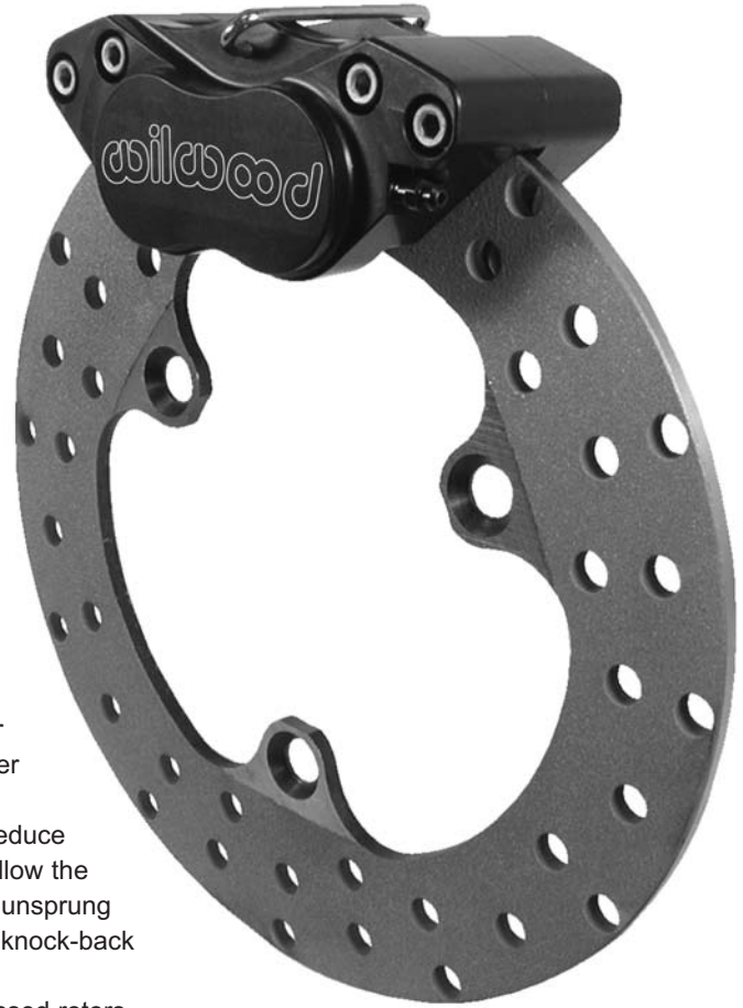
GP 320 Caliper with Drilled PolyMetallic Rotor