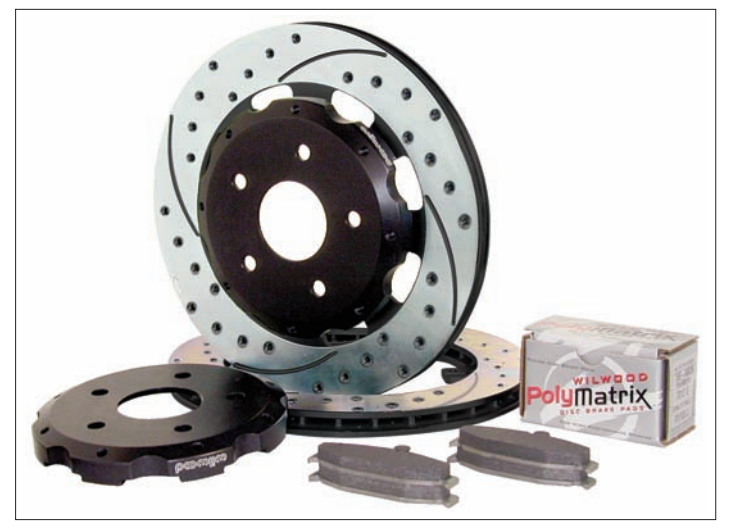
Pro-Matrix C-4 OE Rear Upgrade Pad and Rotor Kit with SRP Rotor