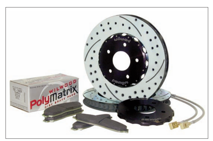
Pro-Matrix OE Front Upgrade Pad and Rotor Kit with SRP Rotor