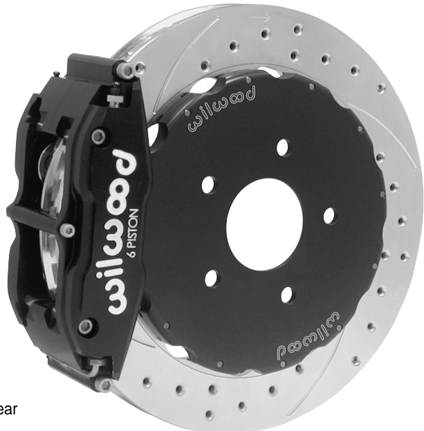
Corvette C-5 Big Brake Front Kit with SRP Rotor