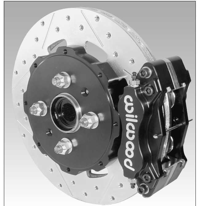
Typical Front Dynalite Big Brake Kit

Installation is Simple The kit is a complete bolt-on without the need to modify any of the stock brake or suspension components and includes detailed instructions. Optional braided stainless steel line kits are available to add the finishing touch to your installation.