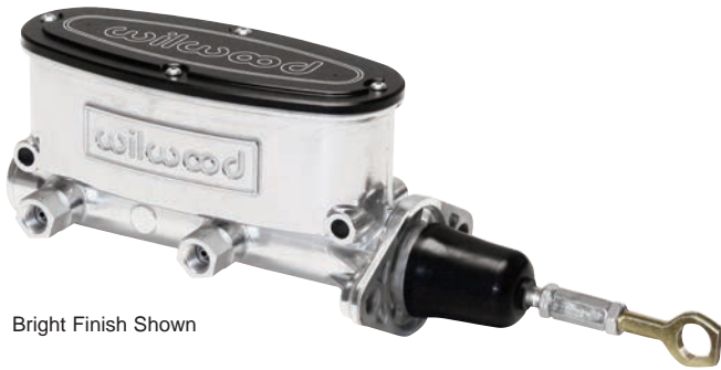
Bright Finish Shown